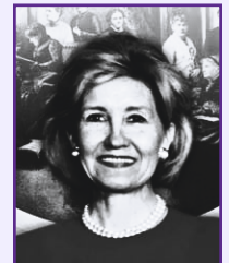
Kay Bailey Hutchison

Tickets must be purchased by Wednesday, March 29 through the preregistration process. See page 97 for registration form.