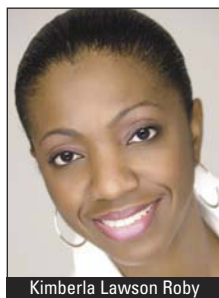
Kimberla Lawson Roby